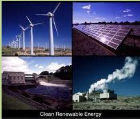
Clean Renewable Energy